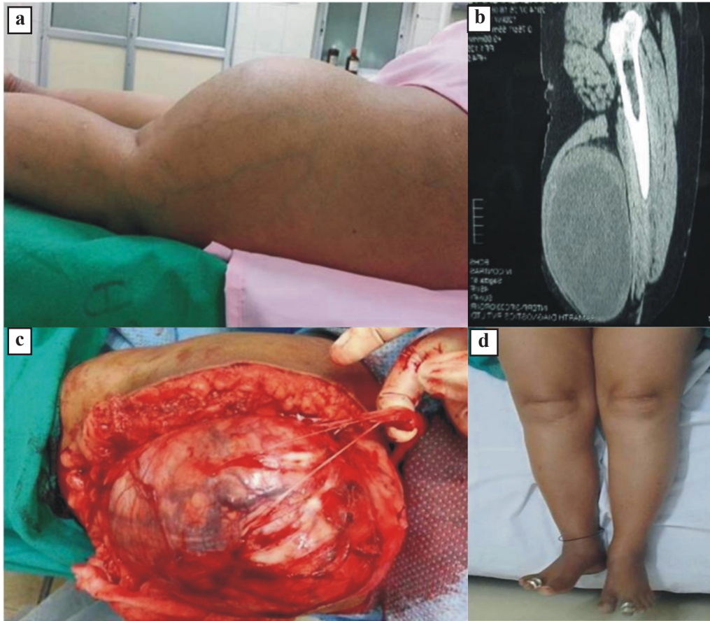
Fig. 1 (a) Massive soft tissue swelling lt thigh. (b) CT scan: Well defined central hypodense mass with peripheral isodense margin. No calcification or fat density. (c) Tumor arising from sciatic nerve. Excision with preservation of tibio peroneal trunks. (d) Normal foot dorsiflexion post operatively.