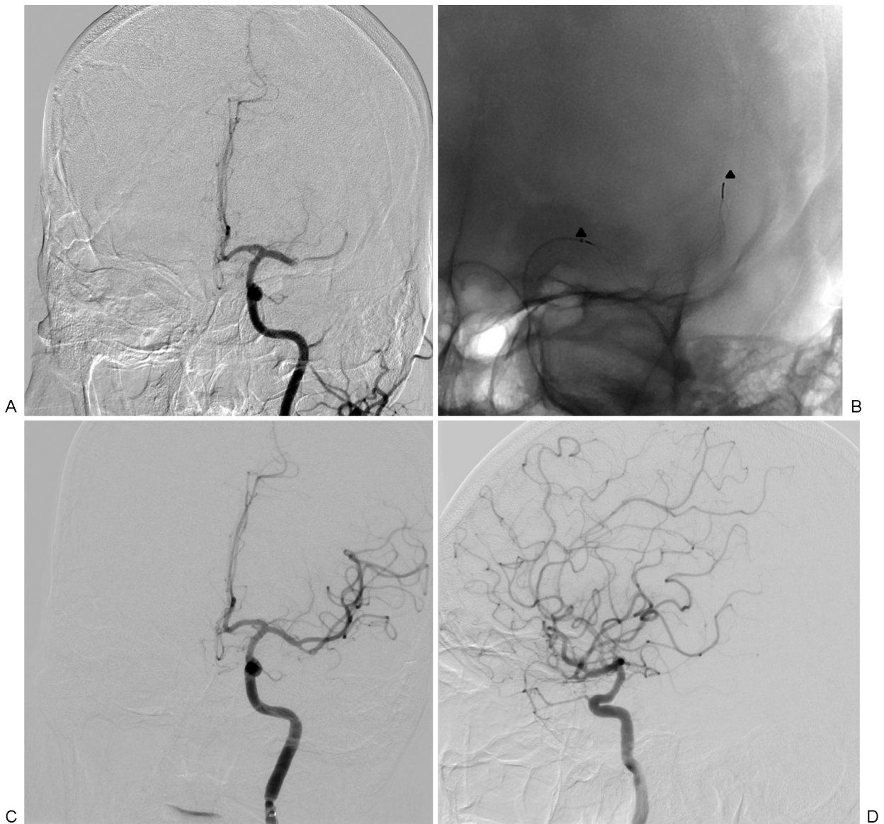
Fig. 1 (A) Left carotid angiogram shows M1 occlusion. (B) Stent retriever deployed across the occluded segment (arrowheads). (C) Anteroposterior projection shows complete recanalization of M1 segment. (D) Lateral projection shows filling of all cortical middle cerebral artery branches.

Door-to-puncture time was 40 minutes. At 24 hours, the patient had an NIHSS score of 2. A follow-up CT showed a small left insular infarct and no hemorrhage. Modified Rankin Scale (mRS) was 1 on discharge. The mRS was 0 at 3-month follow-up.