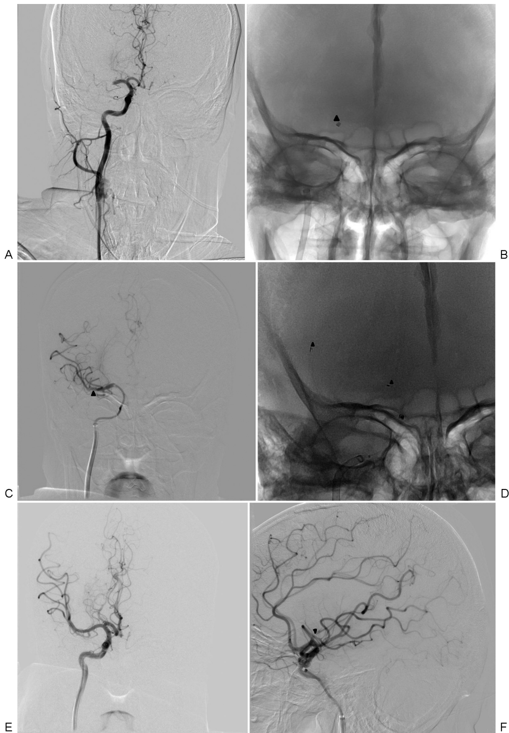
Fig. 3 (A) Right carotid angiogram shows M1 occlusion. (B) Penumbra 5MAX catheter at the proximal end of the occlusion (arrowhead shows the radiopaque marker at the catheter tip). (C) Postsuction angiogram shows persistent filling defect in the M1 segment (arrowhead). (D) Stent retriever deployed across the diseased segment (arrowheads represent end markers). (E) Postsuction angiogram; Anteroposterior projection shows complete recanalization of M1 segment. (F) Lateral projection shows persistent occlusion of the frontal branch (arrowhead) with filling of rest of the middle cerebral artery cortical branches.

An 8F Neuron max guide catheter/sheath (Penumbra) was positioned in the petrous segment of the right ICA. A biaxial system of Penumbra 5MAX catheter, Headway 21, and Traxcess wire was navigated up to the site of the occlusion and suction thrombectomy was performed. Immediate