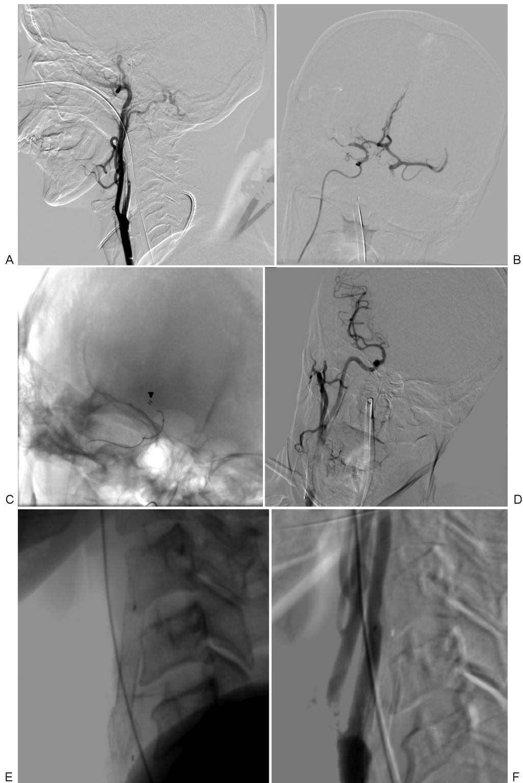
Fig. 4 (A) Right carotid angiogram shows proximal occlusion of the internal carotid artery (ICA). (B) Microcatheter injection from the intracranial ICA showed M1 occlusion. (C) Penumbra 5MAX catheter at the proximal end of the occlusion (arrowhead shows the radiopaque marker at the catheter tip). (D) Postsuction angiogram shows complete recanalization of the M1 segment. (E) Lateral projection of the neck shows the ICA stent. (F) Right carotid angiogram confirms stent patency.

developments in the suction catheter technology allowing for large bore and flexible ones that reliably navigate the twisted and tortuous arteries and those that can be employed in larger vessels like the ICA, there is renewed interest in this